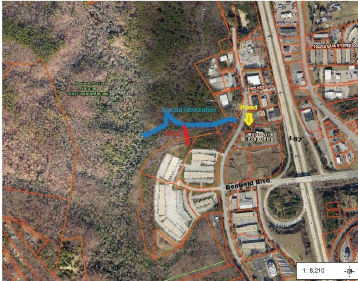
Najole Road Stream Restoration and Pond Retrofit