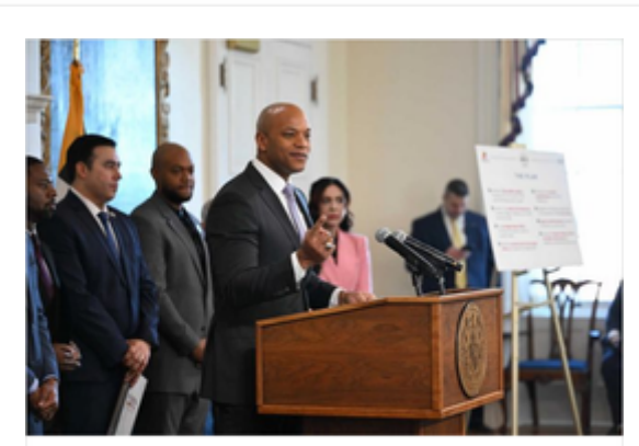
Governor Wes Moore Announces MOVE Maryland Coalition to Boost State Transportation Infrastructure

On Friday, Governor Wes Moore announced the MOVE Maryland Coalition, a partnership of over 40 organizations supporting a $420 million annual investment in the state's transportation infrastructure. The plan aims [...]